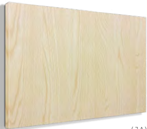
(JA) Japanese Ash