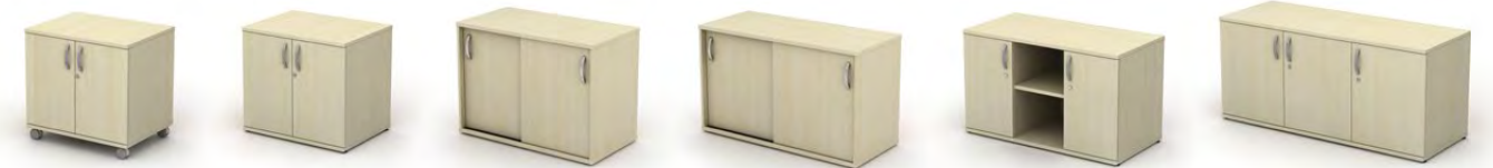
600mm deep mobile cupboard