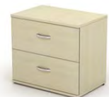
525mm & 600mm deep side filers