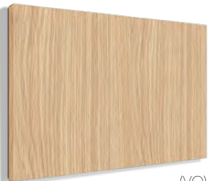
(VO) Verade Oak