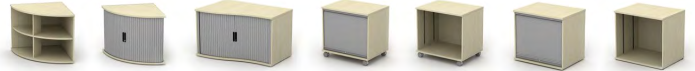
radial end open storage