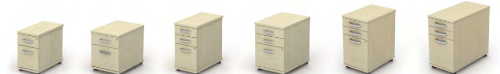
narrow mobile pedestals