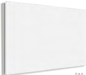
(W) White RAL 9016