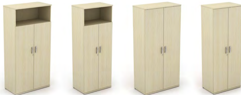
1000mm & 800mm wide open cupboards

(available as 2062mm, 1657mm, 1252mm, 847mm & 725mm high with a choice of handle)