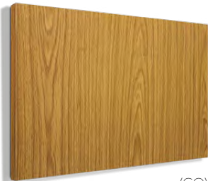
(CO) Calva Oak