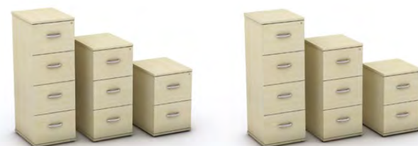
600mm deep filing cabinets (4, 3 or 2 drawers)