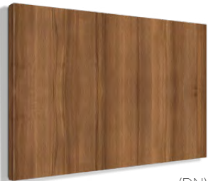
(DN) Dijon Walnut