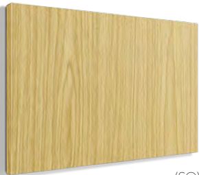
(SO) Stone Oak