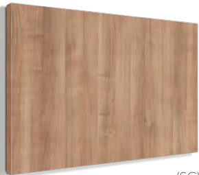
(SC) Santiago Cherry