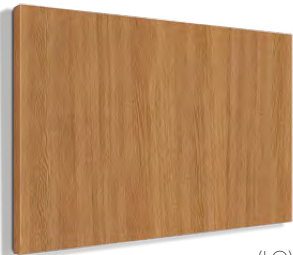
(LO) Light Oak