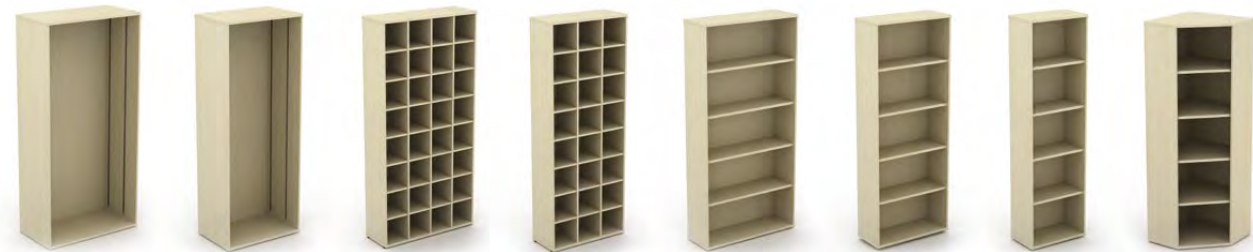
1000mm & 800mm wide open units