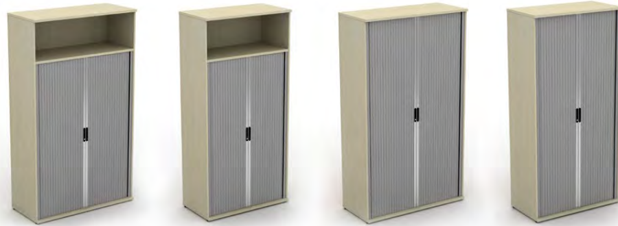
1200mm & 1000mm wide open tambour units

(available as 2062mm, 1657mm, 1252mm, 847mm & 725mm high)