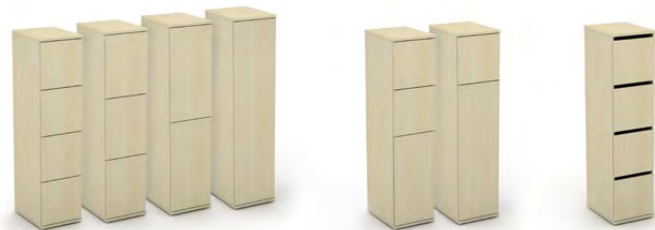
personal lockers available with various door options

(choice of 2, 3, 4 or a single door option)