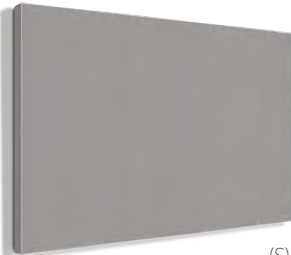
(S) Silver RAL 9006