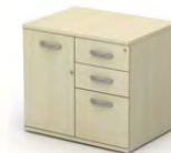
combination cupboard unit