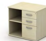
combination open unit