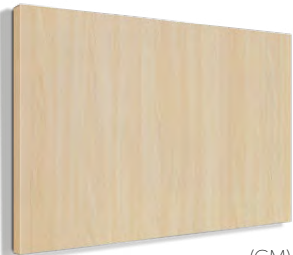
(CM) Canadian Maple